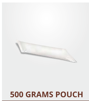
500 GRAMS POUCH