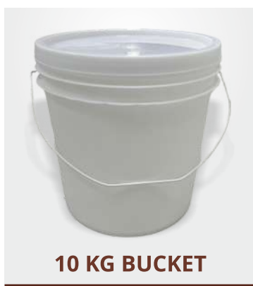
10 KG BUCKET