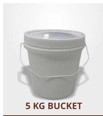
5 KG BUCKET