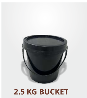
2.5 KG BUCKET