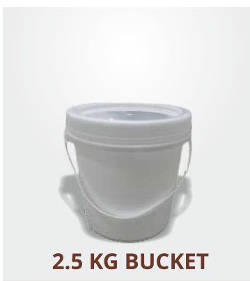
2.5 KG BUCKET