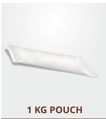
1 KG POUCH