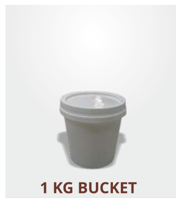
1 KG BUCKET