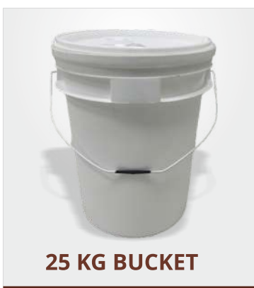
25 KG BUCKET